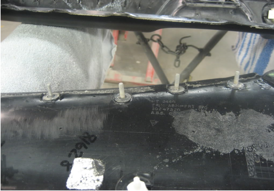
If you get into this project you will find that the corners a bit different and for those I just used a bolt and cut the head off and glued the threaded end where I needed. This picture will make sense if you do this project.