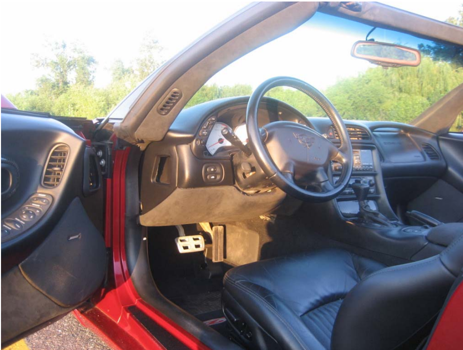
Center console arm rest.